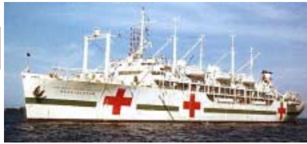
USS Benevolence (US Navy Hospital Ship, 1940).

Naval Ambulatory Care Center, Kings Bay, GA